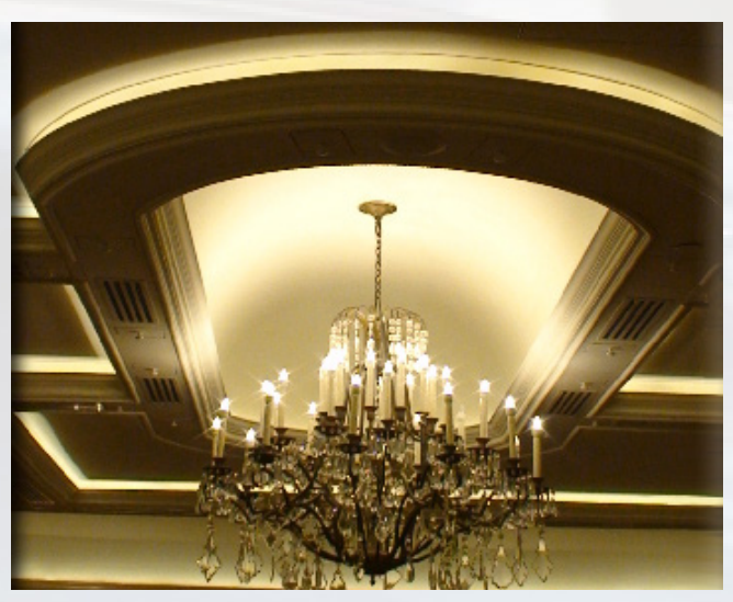
Custom GRG Race Track Dome San Antonio Country Club Ballroom