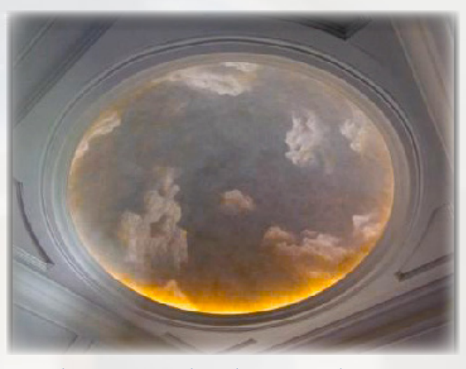
Ceiling Dome with Light Cove and Trim Ring